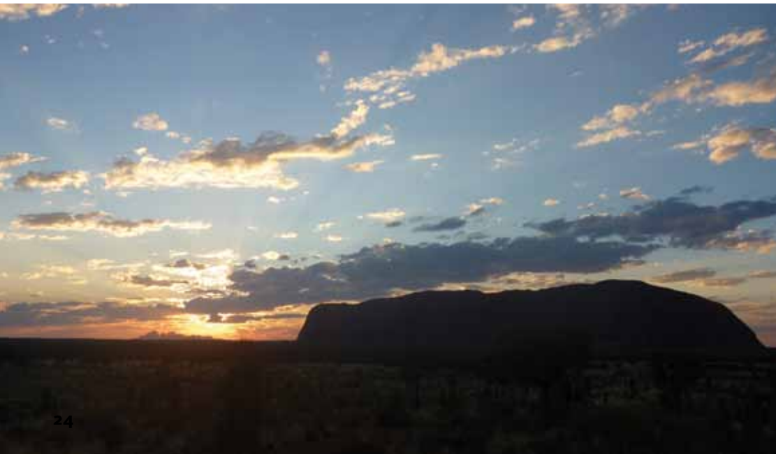
Winter sunset view from Minymaku Platform.

Everyone is welcome on this track to learn about Men's Business such as how to make tools and how men used fire to hunt.